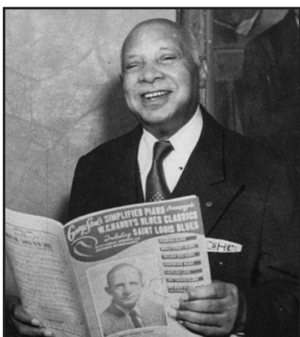
William Christopher Handy

William Christopher (“W.C.”) Handy was born in 1873 in Florence, Alabama. He described his birthplace in his autobiography as, “where the Tennessee River, like a silver snake, winds her way through the red clay hills of Alabama, sits high on these hills my hometown, Florence. Here I came into the world...” Handy held his hometown in high regard, even conveying ownership of his home, a log cabin, and personal items to be displayed in the home, to the City of Florence.