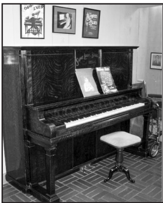
W.C. Handy's Piano

William Christopher (“W.C.”) Handy was born in 1873 in Florence, Alabama. He described his birthplace in his autobiography as, “where the Tennessee River, like a silver snake, winds her way through the red clay hills of Alabama, sits high on these hills my hometown, Florence. Here I came into the world...” Handy held his hometown in high regard, even conveying ownership of his home, a log cabin, and personal items to be displayed in the home, to the City of Florence.