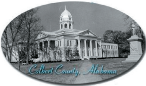
Colbert County Commission