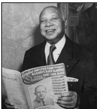
William Christopher Handy

William Christopher (“W.C.”) Handy was born in 1873 in Florence, Alabama. He described his birthplace in his autobiography as, “where the Tennessee River, like a silver snake, winds her way through the red clay hills of Alabama, sits high on these hills my hometown, Florence. Here I came into the world...” Handy held his hometown in high regard, even conveying ownership of his home, a log cabin, and personal items to be displayed in the home, to the City of Florence.