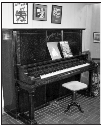
W.C. Handy's Piano

William Christopher (“W.C.”) Handy was born in 1873 in Florence, Alabama. He described his birthplace in his autobiography as, “where the Tennessee River, like a silver snake, winds her way through the red clay hills of Alabama, sits high on these hills my hometown, Florence. Here I came into the world...” Handy held his hometown in high regard, even conveying ownership of his home, a log cabin, and personal items to be displayed in the home, to the City of Florence.