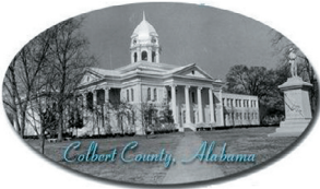
Colbert County Commission